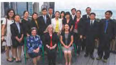
Chinese LLM graduates at a farewell dinner.

"My classes at John Marshall gave me an understanding not only in U.S. IP law, but also the way of reasoning of the law practitioners," he said. "With this knowledge, I've been able to increase my client base."